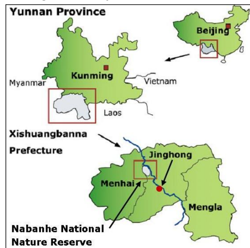
Figure 1: Map of Xishuangbanna Prefecture and its location in China (LILAC 2006)

New rubber plantations established in the last two decades were planted almost exclusively on former forest plots on sloping hillsides, since the valley bottoms are used for the cultivation of paddy rice and other crops. It is thus the tropical forest that has suffered most from the recent expansion of the rubber sector. Therefore, this region exemplifies the typical trade-off between economic development on the one hand and environmental conservation on the other.